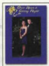
Add text and borders to your photos.

The Instant Imager event photography system comes in a heavy-duty case for easy transportation. Laptop version also available.