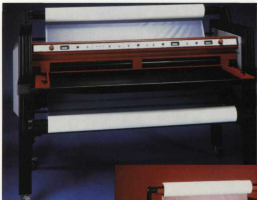
Banner America, Finisher 6300