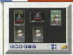
Customers can place orders with the Event Viewer ordering station.