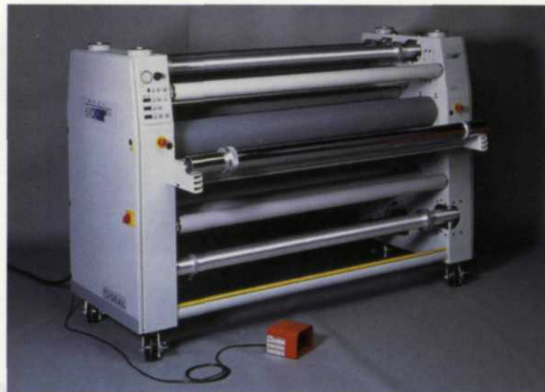
Hunt Graphics Americas, 6100 Ultra