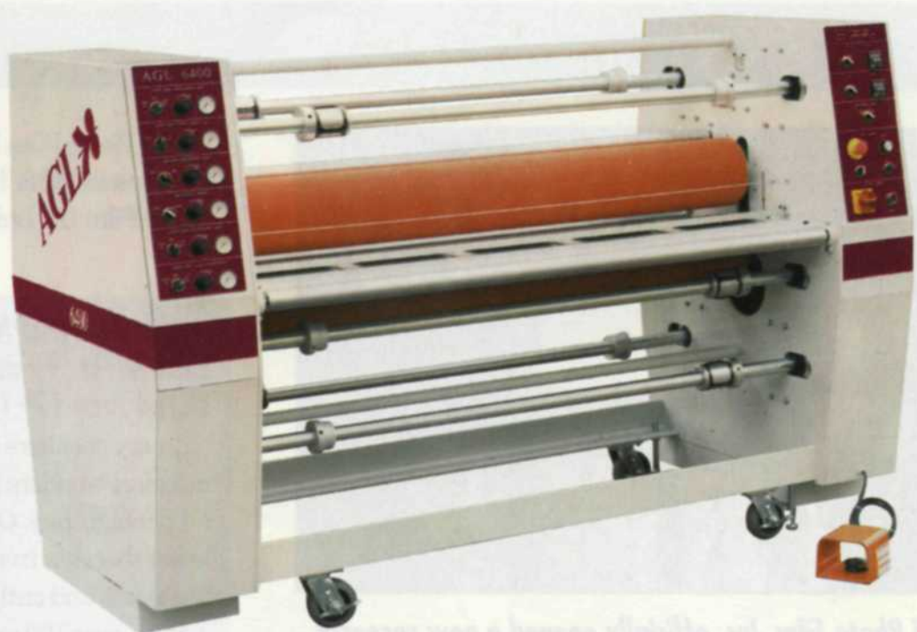
Advanced Greig Laminators, AGL 6400

Mounting and laminating manufacturers were out in full force at this year's PMA show. Each had solutions to the challenges affecting our complex industry. As digital gains acceptance by the industry, laminating manufacturers are being forced to re-evaluate their machinery to accept both traditional photos and digital inkjets.