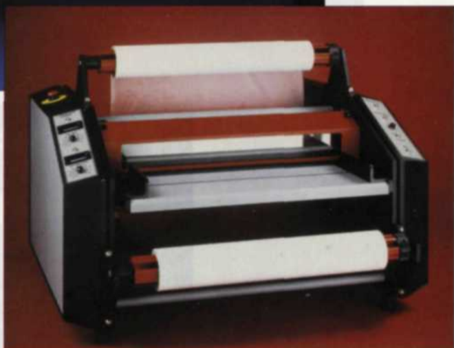
Banner America, Finisher 2700