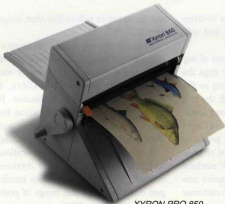
XYRON PRO 850