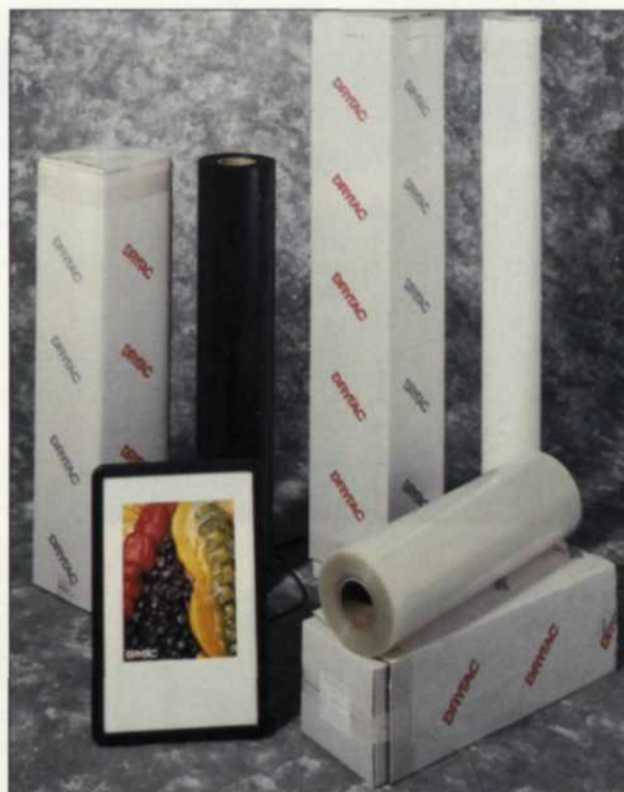
Drytac, MHL gloss, white, and black backing