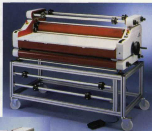
Interlam Model K-1550