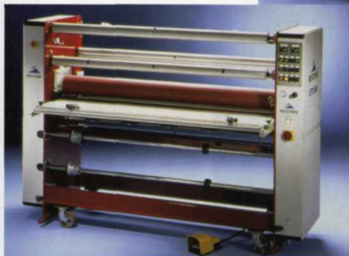
Interlam Jet Lam 1600

nators are great for use with pressure sensitive mounting adhesives and overlaminates.