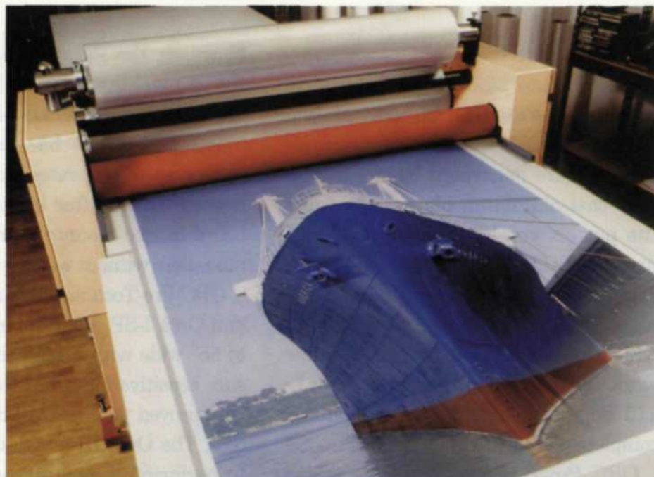
MACtac's Permacolor and Thermacolor overlaminating films and IMAGin adhesive-backed inkjet vinyl can be used together to create a colorful image.