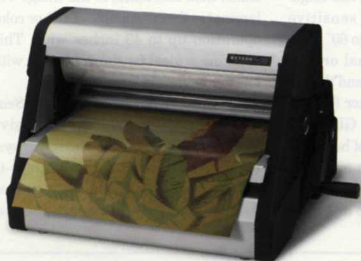
XYRON PRO 1250